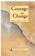
Courage to Change (Large print) (B-17)