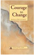
Courage to Change: One Day at a Time in Al-Anon II (B-16)

https://al-anon.org/for-members/members-resources/literature/feature-publications/